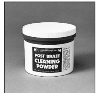
Fig. S47 — Post Braze Cleaner

Dimensions and pressures for reference only, subject to change.